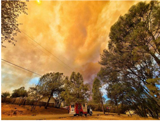
Photo: AMR ambulance responds during CA wildfires.