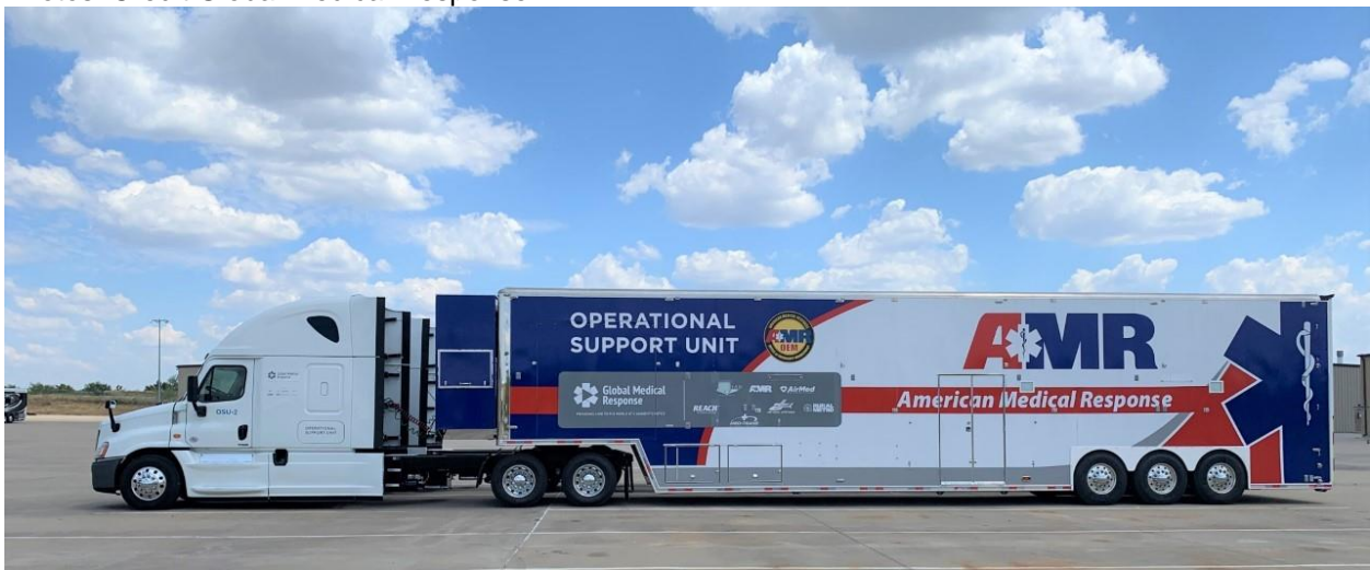
Photo: One of two GMR Operational Support Units sent to help with Hurricane Laura response.